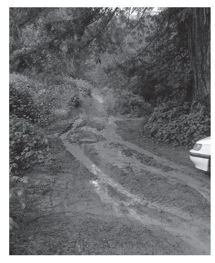
Hobson Creek Watershed. Rural roads can collectively contribute large amounts of sediments to creeks. Stormproofing them is often the quickest way to reduce sedimentation in a watershed.

If you determine that your roads need significant improvements, a road contractor or restoration specialist can help you develop a sediment reduction plan. Be sure to ask your contractor if they have ever attended rural road workshops or worked on road upgrades. Most activities associated with this work will require permits. RCDs are very successful at locating grant funding and implementing rural road improvement projects. They may be able to help you find funding for your project as well as help you implement it. The Mendocino County RCD's Handbook for Forest and Ranch Roads can provide more information on road improvement and management and its methods are approved by the North Coast Regional Water Quality Control Board and the California Department of Fish and Game.