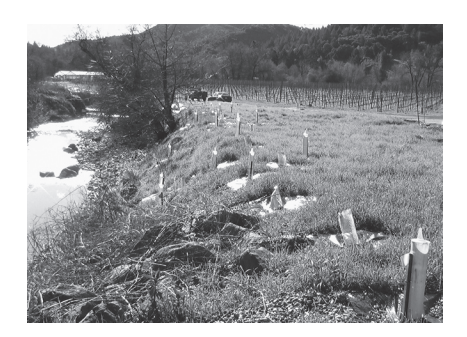
Native plant revegetation on creek bank.