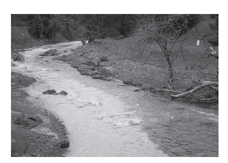
Cummiskey Creek. Sediment rich water mingles with clear stream flows at the confluence of two creeks. Flows on the left indicate excessive upstream soil loss.