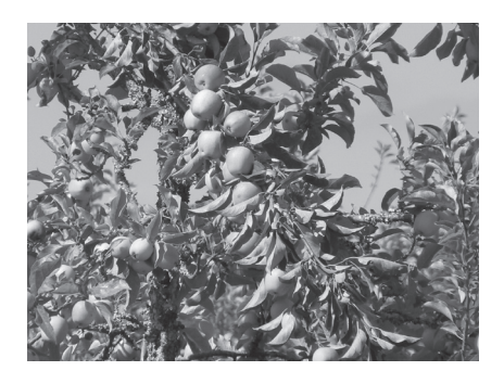
Apple tree, Green Valley Watershed