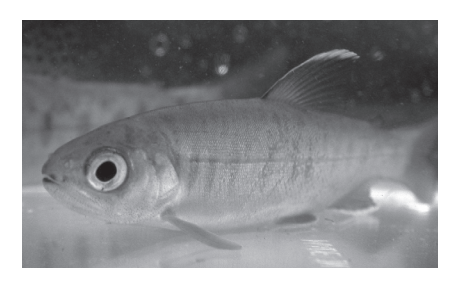
Coho Salmon, BY BROCK DOLMAN

There are a variety of conservation programs available to farm and ranch owners throughout the Russian River Watershed that can assist in the identification of Best Management Practices and restoration activities needed on their properties. Contact your local RCD or refer to the resource section of this guide for more information.