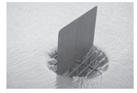
In paved environments, water flows directly through storm drains into creeks. This rapid introduction of water into streams, instead of into the ground, can increase flooding in large storm events.