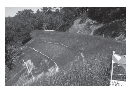
Pena Creek Watershed. Slide stabilization.