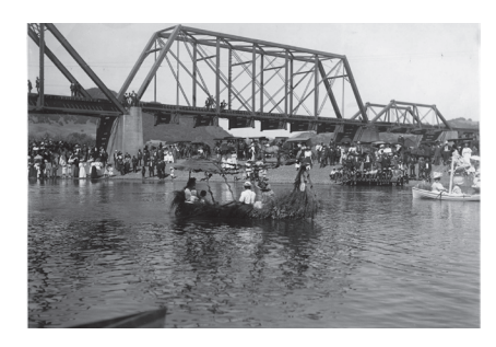
Memorial Beach, 1909

Pomo and Miwok Indians have inhabited the Russian River Watershed for thousands of years. They once thrived off the natural resources provided by the river, hunting game, catching salmon, and weaving some of the world's most beautiful baskets from riparian plants. In the summer much of the river would dry up, but life would persist with fish surviving in deep shaded pools in both the river and creeks. These pools are the rearing habitat for steelhead trout and coho and Chinook salmon: a place for them to grow before migrating to the ocean to mature. They rely on riparian habitat once again when they return to their native waters to spawn. While parts of the mainstem of the river are used by Chinook as spawning habitat, it is the highway home for coho salmon and steelhead trout. Their destination is the hundreds of miles of tributaries and creeks that feed the Russian River and comprise a vital role as their spawning and nursery habitat.