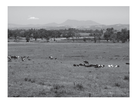
Laguna de Santa Rosa

wild coho have been seen (DFG, 2005). Common land uses within the Dutch Bill Creek Watershed include timberland, rural residential, camps and conference centers, and a limited number of orchards, vineyards, and pasture. The Sonoma County General Plan designates Dutch Bill Creek and its tributaries as "riparian corridors" and as "scenic landscape."