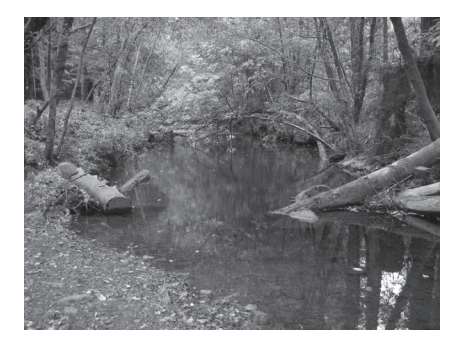
Dutch Bill Creek

Dutch Bill Creek is a tributary to the Russian River that originates near the Town of Occidental in west Sonoma County. The creek flows northwest along Bohemian Highway and drains into the Russian River near the town of Monte Rio. Historically, Dutch Bill Creek was good habitat for listed salmonids. Today it is one of the few streams where