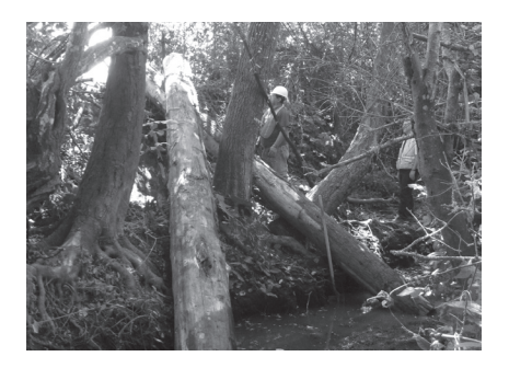
Installation of large woody debris for fish habitat.