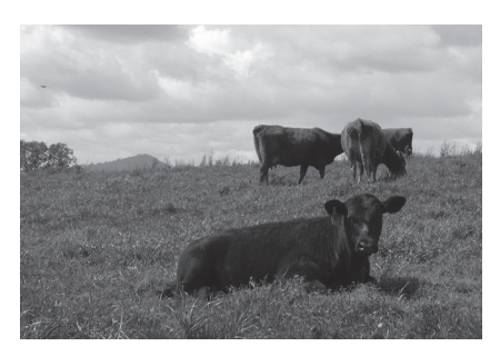
Dairy and beef cattle production remain a sizeable part of the agricultural tradition of the Russian River watershed.