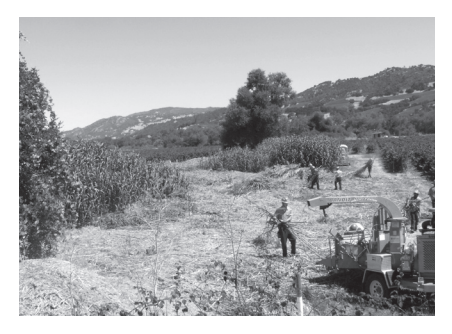
Removal of Arundo donax near the Russian River.

is also recommended to keep a written record of things you notice on your property and make sure you date all of your maps and entries.