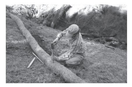
Erosion control installation. Little Black Mountain, Austin Creek

Following are some commonly used erosion control techniques. The reference section at the back of this guide includes sources of materials as well as places to get more detailed instructions: