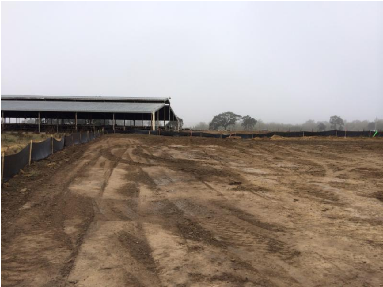
Caption: Sonoma RCD works with a local dairy to install water quality improvement practices.

LandSmart® Promoting productive lands and thriving streams in Sonoma County since 1946