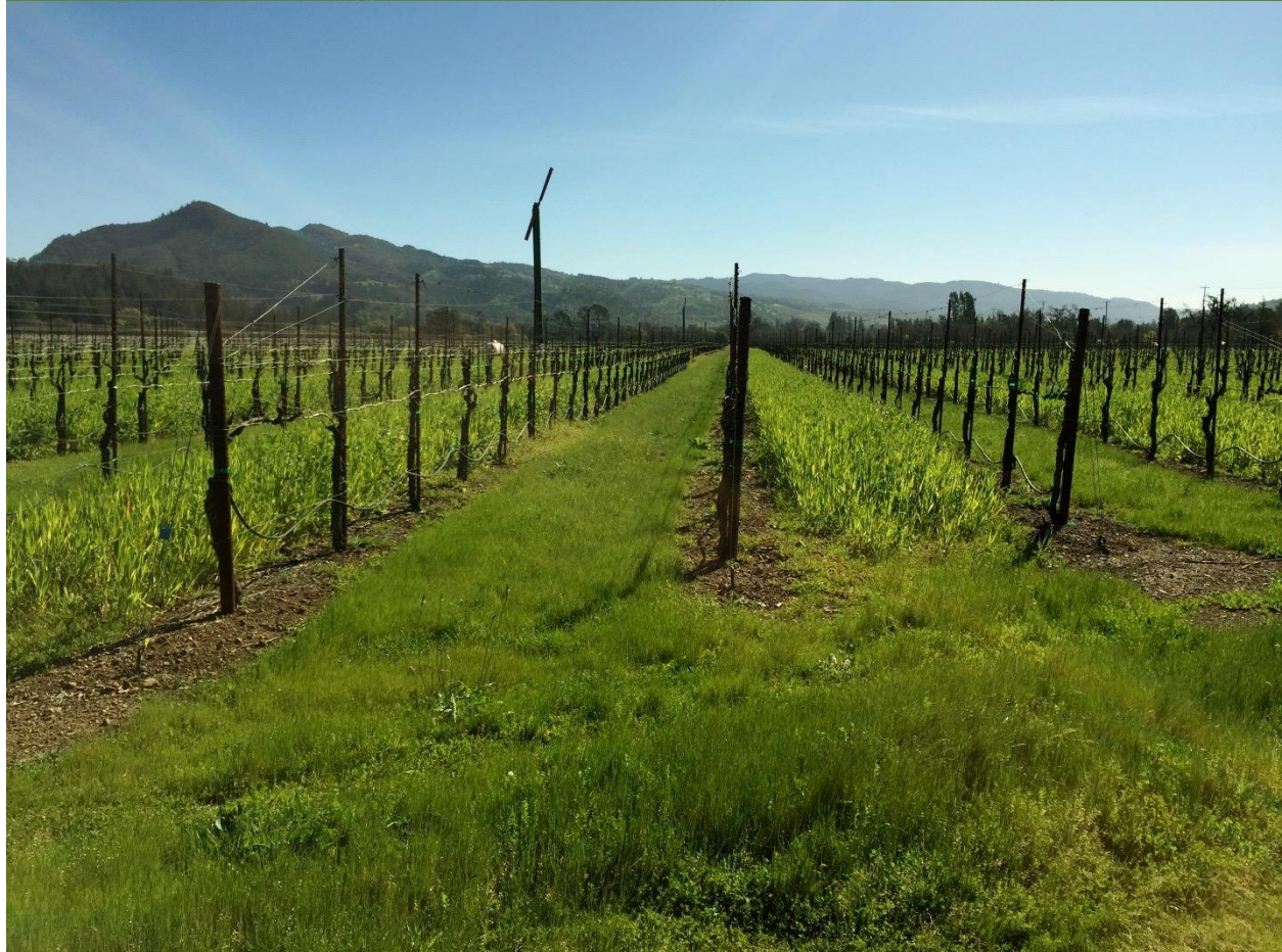
Caption: A vineyard who partnered with the Sonoma RCD to seed a cover crop between the rows to conserve top soil and soil moisture.

LandSmart® Promoting productive lands and thriving streams in Sonoma County since 1946