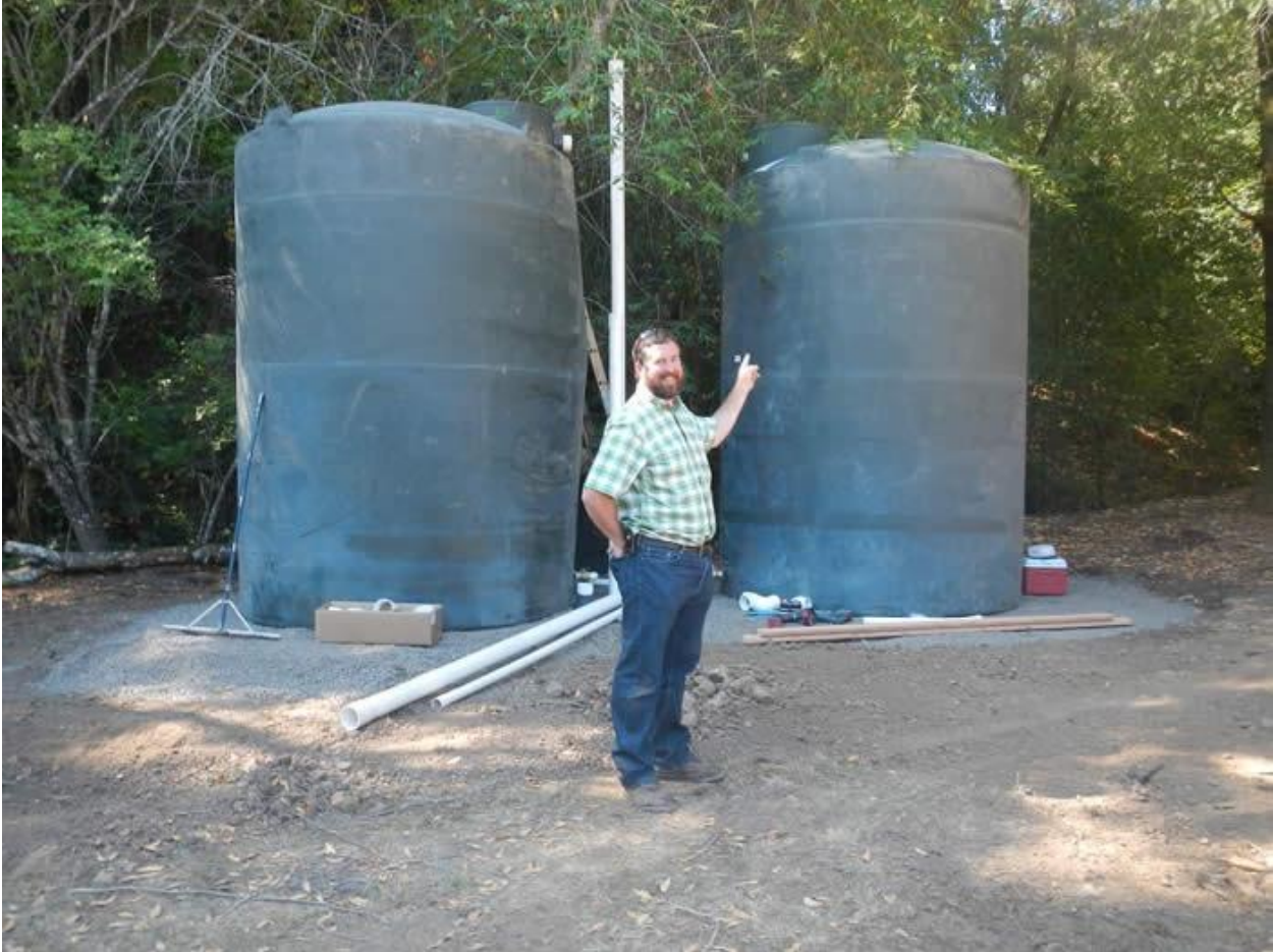
Caption: Sonoma RCD staff points at two 5,000 gallon rainwater catchment tanks on gravel pads at a rural residential property in Mill Creek watershed.

LandSmart® Promoting productive lands and thriving streams in Sonoma County since 1946